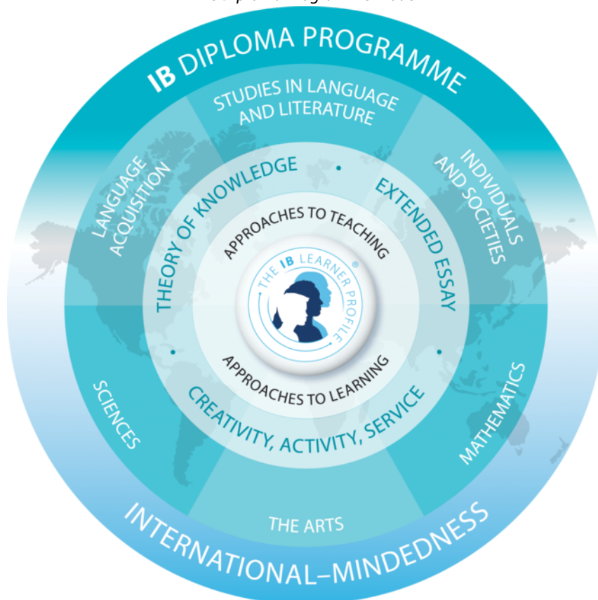
The Diploma Programme model